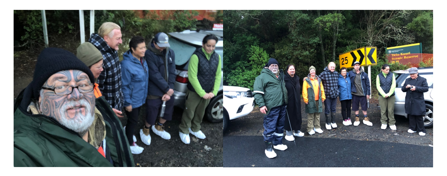
Ka puta mai e ngā 'Tohu' ki te awatea