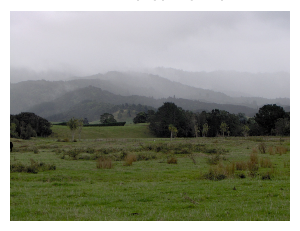
Rerenga kōrero (Historical Reference)

Na Kaihoro e tito ēnei kupu rāpopoto hai pātere Sept 2018