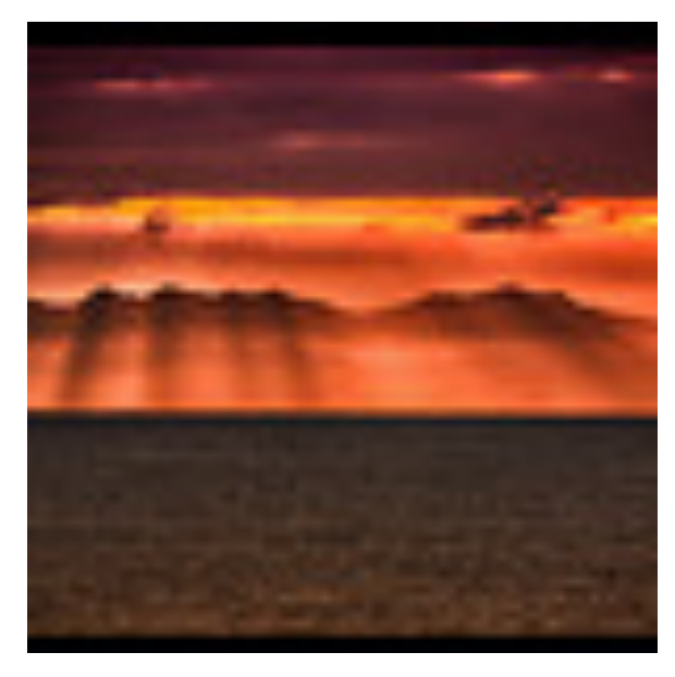
Te aranga ake o te rangi mā runga i a Moehau maunga.