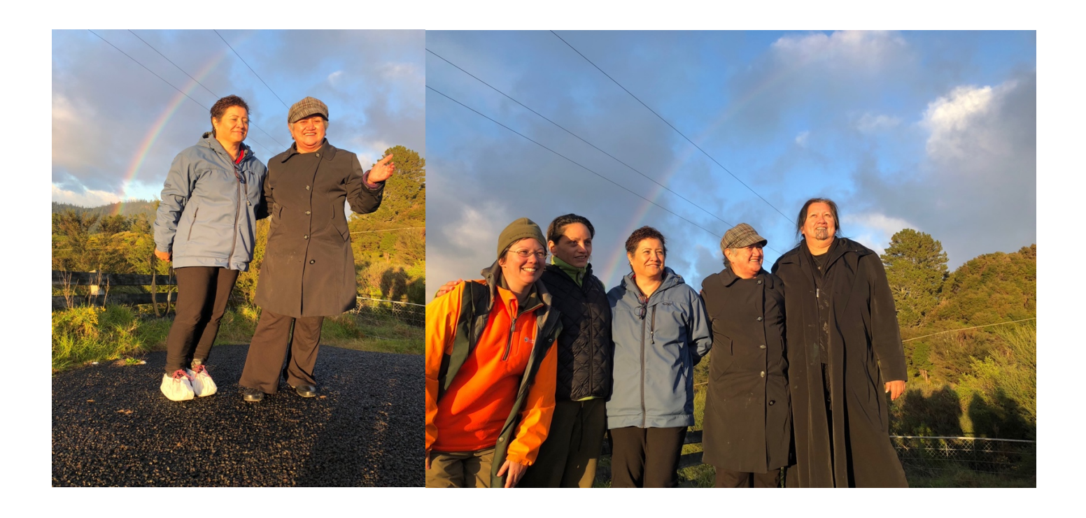
Ka kitea te ngāhere e noho pāpouri ana ki Hauāuru, ahakoa tērā, ka puta mai he kōpere aniwāaniwā ki te hari hari, koa koa te hunga tangata.