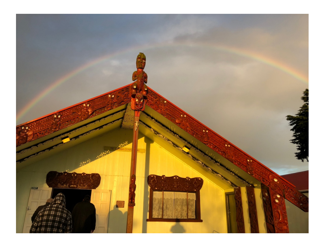
Mātai Whetū Marae, Kopu, Thames

Twin Kauri Scenic Reserve, Tairua (Wāhi taki e ngā Kārangaranga me te Karakia